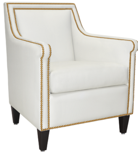
Model: VNV1111 28.5W 32D 35H 22SW 20SD 19.5SH 25AH

The Vinovo Lounge presents a seating option that is uniquely luxurious. Comfort level assured with an abundance of plush back and seat cushions. Heads will turn to view the double row of decorative nail head trim along the arms and back; all standard on the Vinovo. Extended arms create easy to grasp handgrips.